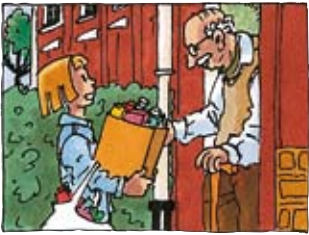
go shopping for neighbours

They're going to play music in the street.