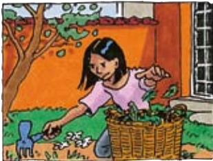
do garden work