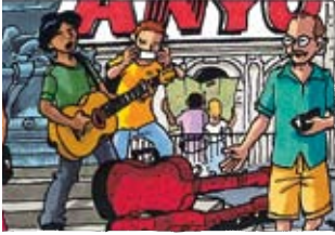
play music in the street

What are they going to do to make money? Write questions and answer them.