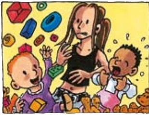
look after children

1. How about Emma? Is she also going to play music in the street?