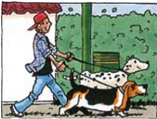
walk other people's dogs

2. What are Gillian's plans? Is she also _____